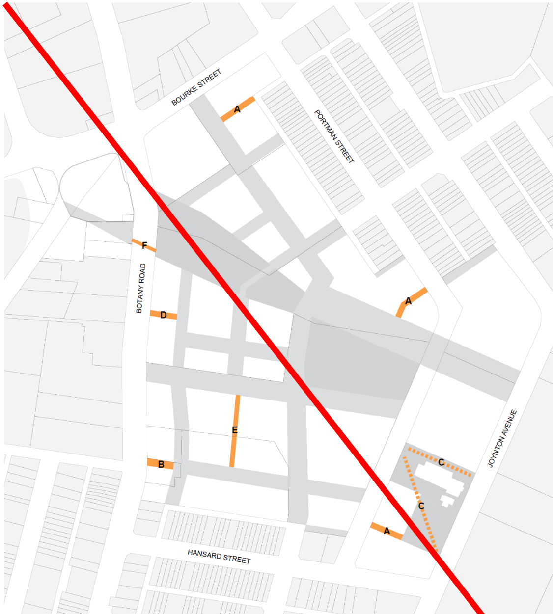
Figure 3.27 Through-site links and arcades (Existing graphic below proposed to be deleted and replaced)