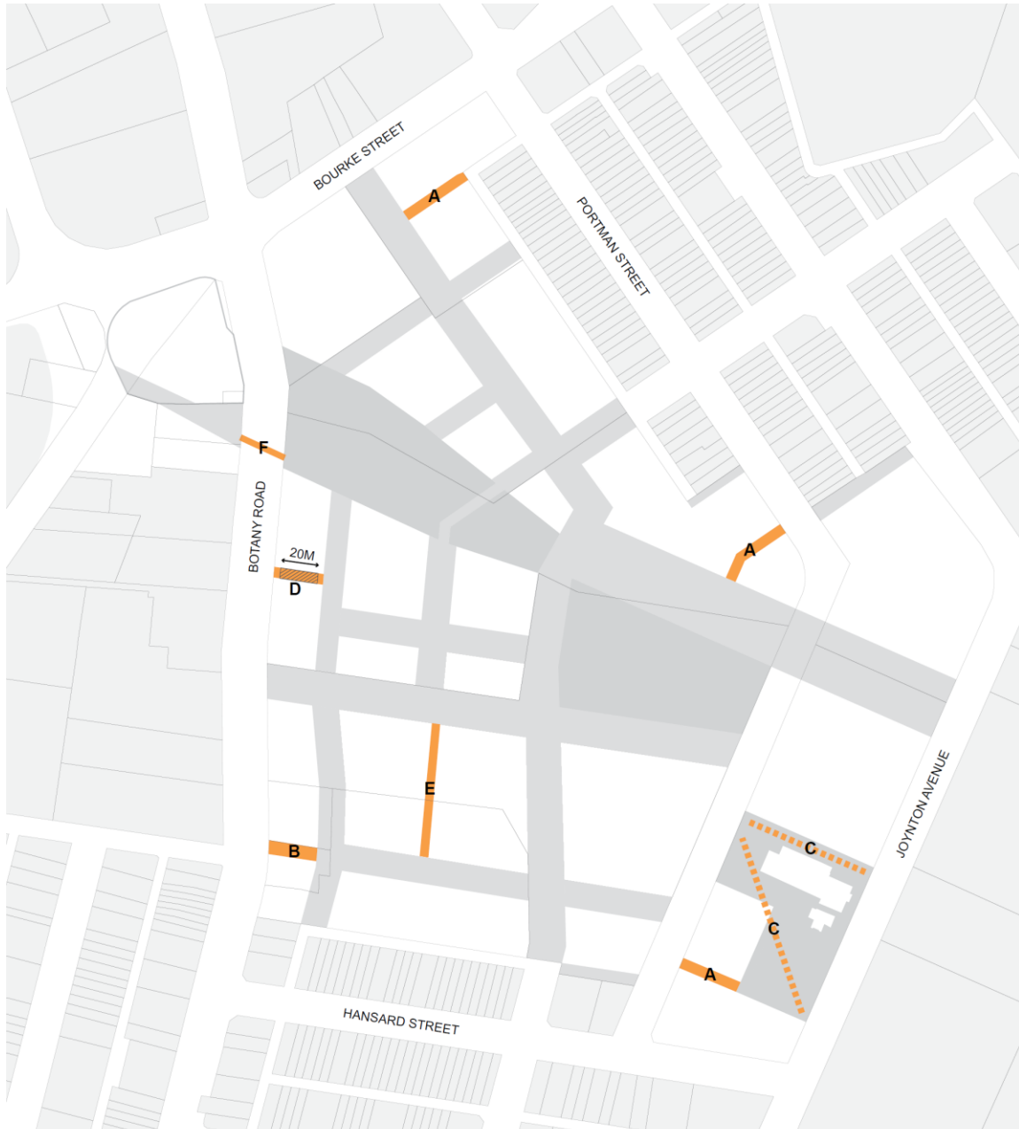
Figure 3.27 Through-site links and arcades (New graphic below proposed to be inserted)